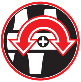
The HC-1501 features adjustable cutter clearance

ECHO's HC-1501 is a 21.2cc twin blade hedge cutter. It features laser cut double reciprocating blades for long lasting sharpness, and has an effective cutting length of 499mm.