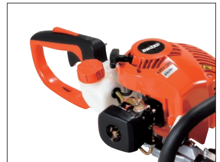
The HC-1501 features a vertical fuel filler neck for easier re-fuelling

A superior directional exhaust protects both the user and the hedge from hot exhaust gases, preventing scorching and discolouration of the foliage. A vertical fuel filler neck allows for easier refuelling.